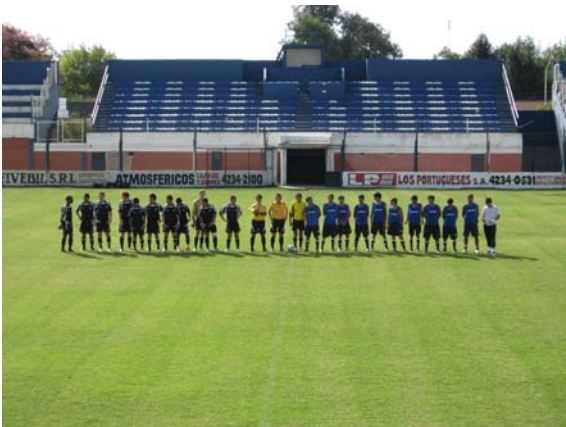
The two teams at Tristan Suarez